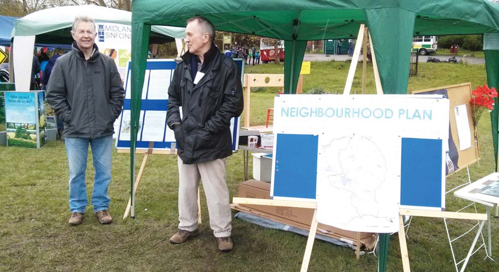
Chairman of the Parish Council and Chairman of the Neighbourhood Plan Setting up the Picnic in the park May 2016